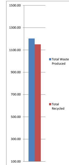
New Construction Flow Chart